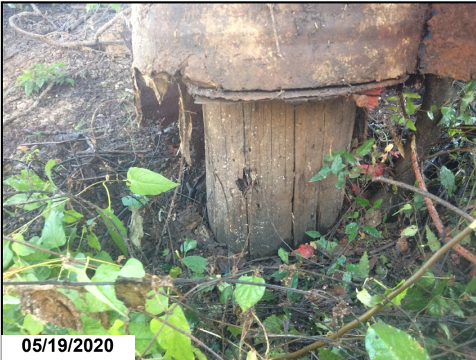
Bent 5 pile 3 outer decay below splice.