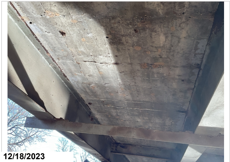
Span 2 bay 1 under view of deck has cracking with efflorescence.