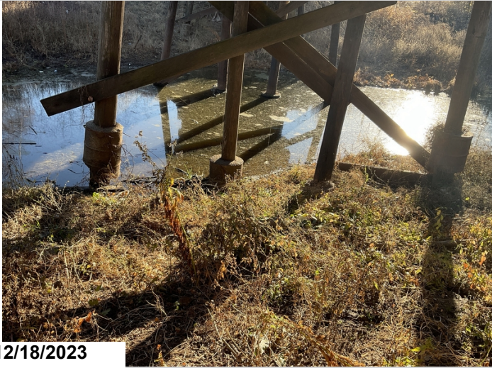
Bent 3 piles.