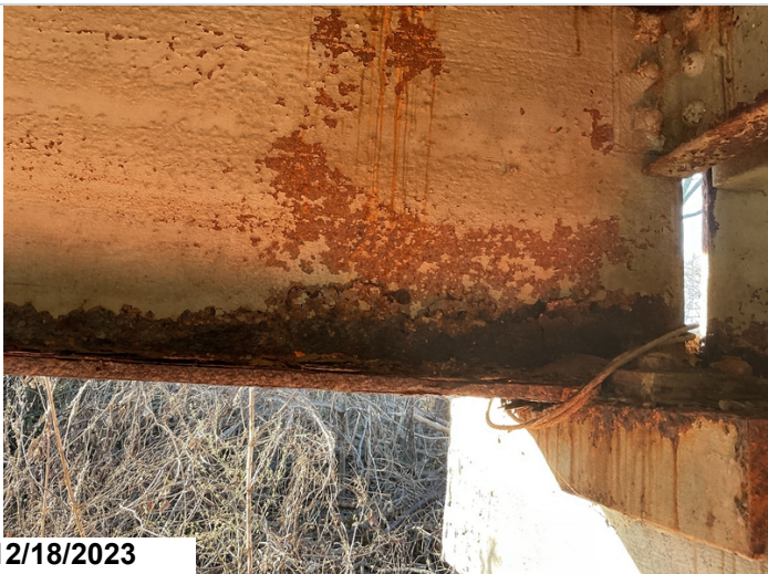
Span 2 Bent 2 girder 4 has heavy flaking rust.