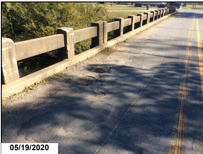
Deck - Spans 1-2 left gutterline (potholes)