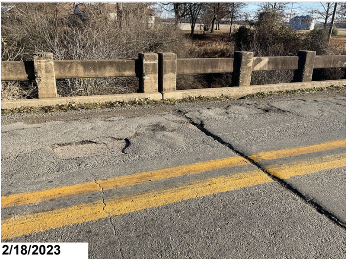
Deck Bent 2 has spalls and delams. Common through out deck