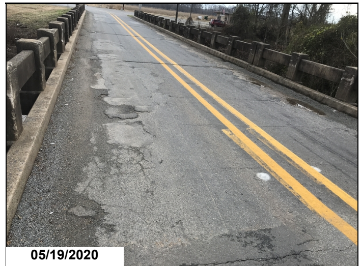
Deck - Spans 1-5: Typical