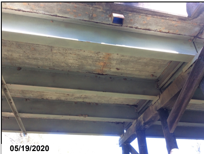
Girders - Span 4 @ Bent 5 (corrosion)