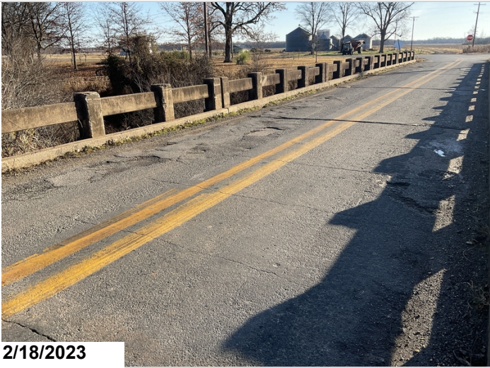
Deck over view.