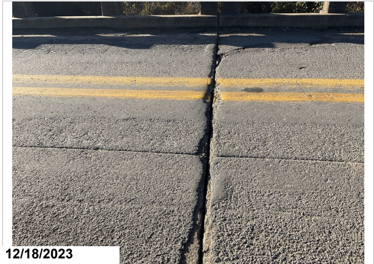
Bent 3 joint seals are missing.