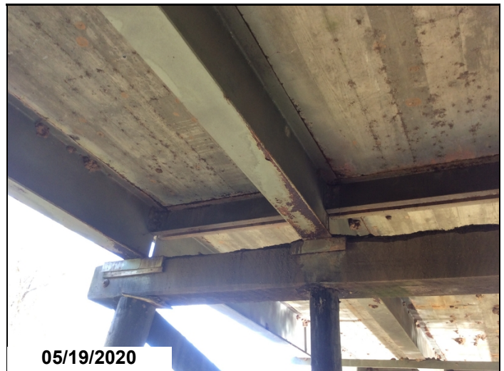
Span 2 Girders 1-2 @ Bent 3 (corrosion)