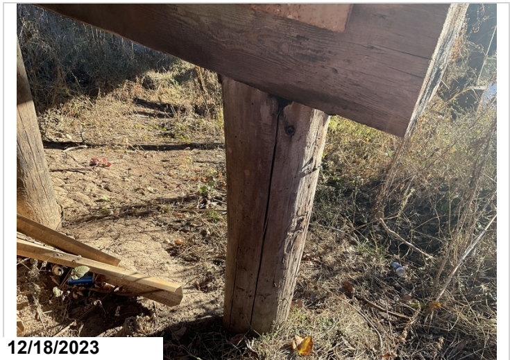
Bent 2 pile 4 has large checks.